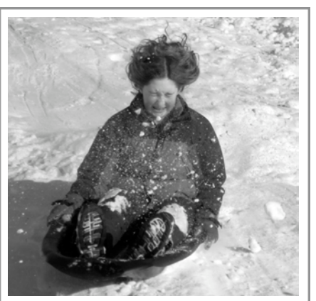
Holding on tight!

Or is it? A group of teachers, staff and students from Jamestown Elementary went on a fun-filled, after school sledding trip Tuesday, February 22. Students, and especially the staff, discovered that sledding is indeed downhill; but that same sled must get back up the hill somehow!