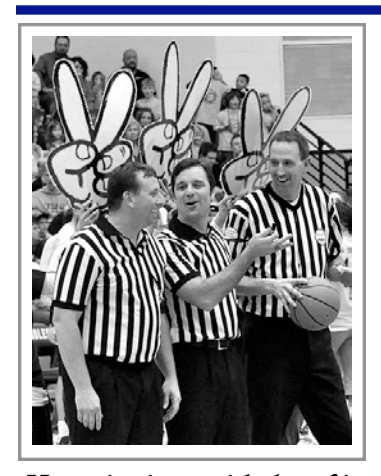
Hamming it up with the refs!