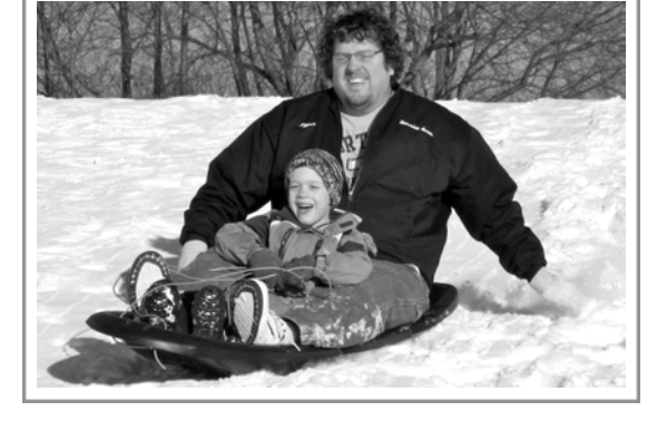
It's hard to say who enjoyed themselves more, the teachers or the kids!