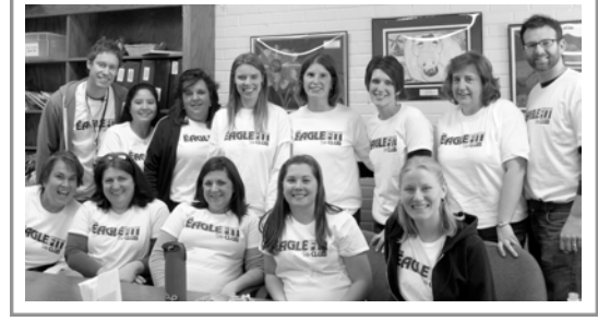
South Elementary Fit Club

As a result of the success of the employee Eagle Fit Club, we have extended the program to some elementary buildings to pilot an Eagle Fit Running Club for students. The kid's club members will train for the Fifth Third River Bank Run during the months of April and May and log points related to the Eagle Fit goals. As an incentive, the Eagle Fit Running Club members will also receive a special pre-race party the day before the River Bank Run if they reach the goals.